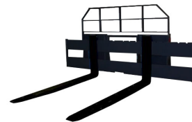
F5560 F5572 F5584